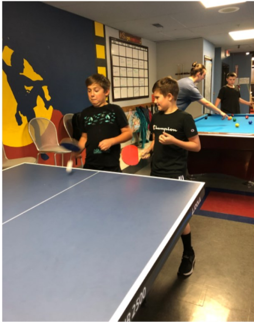
Building new and healthy friendships is part of Rocksolid's Mission!

Open House! Wednesday, Oct 12th 5:30-7pm AT ROCKSOLID