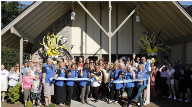
Thank you to ALL who attended our ribbon cutting in honor of our 20th year! We are so grateful!